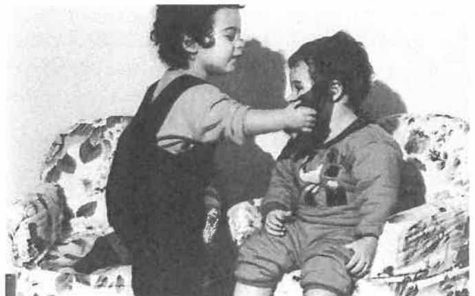
9. Will Letizia's shoe transform itself into a phone receiver as did Chiara's shoe?