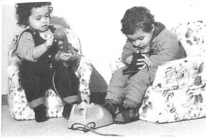
5. who explores it with attention.